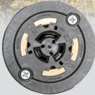
ANSI C136.41 (7-Pin)

Available in Standard or ANSI C136.41 (7-Pin)